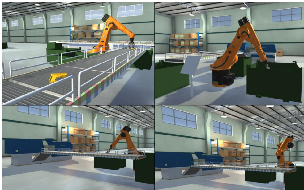
Figure 2. Snapshots from the VR module.

To achieve the goals of curriculum integration, the authors are developing VR teaching modules for a manufacturing system to be used in the IE Department at Pennsylvania State University. However, the module could potentially be used by students and faculty from other universities. During the development phase, several outcomes will be measured and assessed by a group of students and faculty members. The assessments will include various aspects ranging from the efficacy of the VR module to the hardware devices selection. Figure 2 shows snapshots from the work-in-progress system. The following sections describe the framework of the CLICK approach.