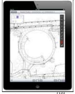
Figure 6: IPad<sup>[10]</sup>

IPad and Tablets: There are a number of available tablets on the market that function as portable computers. These tablets have the ability to perform all of the functions of the previously discussed smart phones. The underlying difference in regular smart phones and their tablet counterparts is that tablets do not have the ability to place or receive phone calls without the use of third party software. Tablets would be a reliable method of replace laptop computers on construction sites but would have limited applications as a primary means of communication. (See Figure 6)