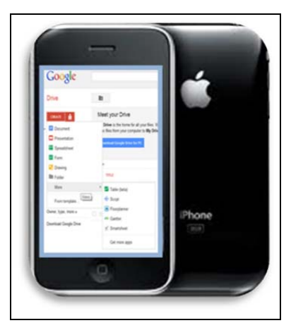
Figure 9: Google Drive on I-Phone

If you choose "More", you will have access to more applications such as Auto CAD WS, Floor Planner and so on.