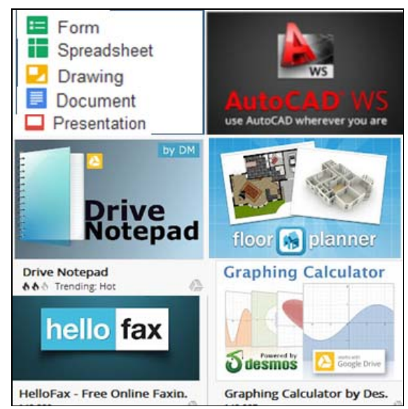
Figure 10: Some Google Drive Applications that can be used in construction site

5. After opening one of the documents, you can select the team members that document should be shared with them. This will be possible by clicking on "Share" icon on the top right side of screen (See Figure 10).