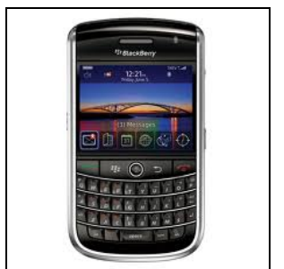
Figure 4: Blackberry Smart Phone<sup>[7]</sup>

Blackberry: The blackberry is an adaptable smart phone for on-site personnel. The Blackberry is capable of internet access, sending and receiving email, and taking digital photographs. There are also a wide variety of existing applications for the construction field such as Constellation Homebuilding Systems, BuilderMT, ReportAway! ForFreshbooks, TeleNav Track, and Go Canvas.