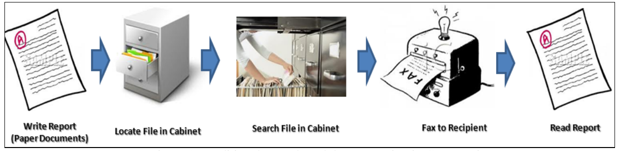
Figure 1: Traditional paper based documentation in Construction

In the past and perhaps still prevalent in many construction companies, paper documents were filed in a cabinet. When a particular document was needed for work or editing, clerical staff would have to search for the document then fax, mail, or transport the document to the recipient. Figure 1 shows the traditional paper-based documentation process for construction projects.