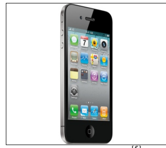
Figure 3: iPhone 4<sup>[5]</sup>

IPhone: The iPhone can has a wide range of capabilities ranging from placing phone calls, browsing the internet, sending and receiving emails, and teleconferencing. The iPhone would be well suited for on-site personnel in the construction industry. The iPhone boasts an 8-megapixel iSight camera, which is of high digital quality. The 8-megapixel camera combined with the email capabilities would allow high resolution pictures to be viewed and sent. There are a wide variety of applications, or apps, available for download on the iPhone. Apps are available for purchase through the Microsoft Corporation and are frequently updated. The iPhone has the capability of opening a wide variety of documents to include: .jpg, .doc, .pdf, .ppt, .xls, etc. This means that users of the iPhone will have the capability of accessing all documents on-site. This prevents the need for personnel to seek out a computer to open important files <sup>[2].</sup> A unique feature of the iPhone which would be of particular for communicating between on-site and office based personnel is the Face time capability of the phone. The Face time feature allows for digital teleconferencing on the go. In this way the iPhone would allow planners and managers to speak face to face with on-site personnel anywhere in the world as long as there is an available internet connection <sup>[7]</sup>. (See Figure 3)