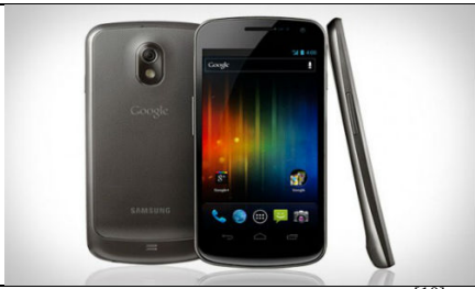
Figure 5: Samsung Smart Phone<sup>[10]</sup>

Android Platform: Samsung Smartphone operates on the android platform and is available in a variety of models. Top end Samsung models offer an 8-megapixel camera which provides high resolution photographs. They have the ability to browse the internet and send and receive emails. The android platform is Microsoft office compatible which means managers are able to utilize the smart phone without additional investment in software packages. Samsung smart