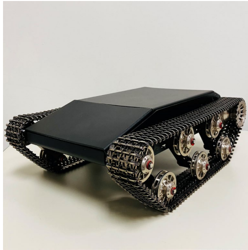
Figure 4: Photo of the robotic, differential-drive vehicular platform.

importance to manufacturers [11]. The creation of a DT is a complex task involving modeling, simulation, and data connectivity and processing, in tandem with the complexities of working with the mechatronic vehicle system.