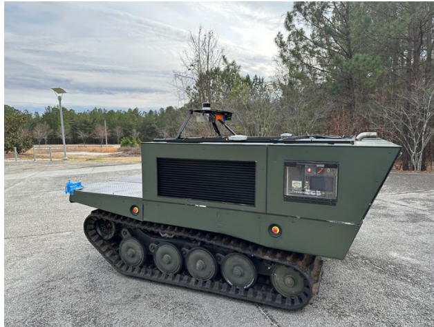
Figure 5: A custom designed and fabricated off-road tracked vehicle developed through by the Deep Orange team in collaboration with the VIPR-GS Center at Clemson University.