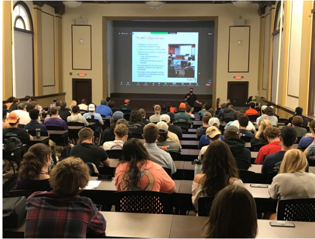
Figure 3: Image of seminar conducted by the Product Lifecycle Management Center for sophomore engineering students.

One solution for teaching PLM that avoids extending engineering programs is providing it as an extracurricular activity. This paper presents a case study of a semi-extracurricular project group designed to teach PLM to undergraduate engineering students. The project group is an elective, reoccurring, semester-long class project that has been running for two years and enrolls, on average, six participating students per semester. It is sponsored by the PLMC and utilizes all the resources presented and housed by the center, as discussed earlier.