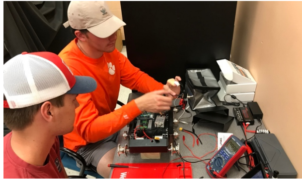
Figure 6: Students working on the mechatronic system of the robotic vehicle as part of a guided project.