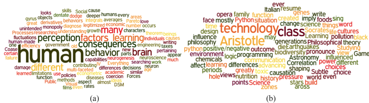
Figure 2 - Word cloud representation of responses regarding the most interesting fact or concept learned in classes (a) WITHIN and (b) OUTSIDE of students' majors.

Students were also asked to describe the most interesting fact or concept learned in a class inside and outside of their major, respectively. Figure 2.a represents a word cloud representation of answers pertaining to concepts learned inside their major. Interestingly, human-related topics were by far the most common answer provided, a pattern that is likely quite different than that observed in students taking standard programming or engineering courses. With respect to concepts learned outside of the major (Figure 2.b), technology was one of the most common responses. This pattern indicates that, although students' primary interests may lie within the social sciences, nonetheless they have an interest in learning technology -- potentially contributing to their motivation for enrolling in ENGR 120.