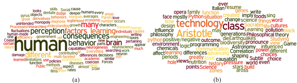
Figure 2 - Word cloud representation of responses regarding the most interesting fact or concept learned in classes (a) WITHIN and (b) OUTSIDE of students' majors.

Students were also asked to describe the most interesting fact or concept learned in a class inside and outside of their major, respectively. Figure 2.a represents a word cloud representation of answers pertaining to concepts learned inside their major. Interestingly, human-related topics were by far the most common answer provided, a pattern that is likely quite different than that observed in students taking standard programming or engineering courses. With respect to concepts learned outside of the major (Figure 2.b), technology was one of the most common responses. This pattern indicates that, although students' primary interests may lie within the social sciences, nonetheless they have an interest in learning technology -- potentially contributing to their motivation for enrolling in ENGR 120.