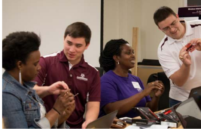
Figure 4. Teachers using TI LaunchPad