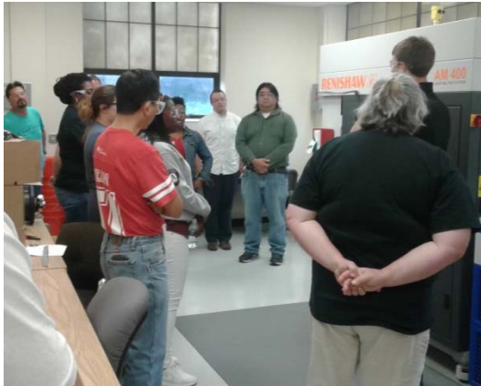
Figure 2. Tour of AM Equipment

the process, and create practice-parts, as well as the enclosure for housing the IoT kit contents.