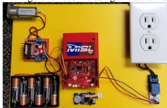
Figure 5. Integrated System Driven by TI LaunchPad

Using these IoT resources, teachers were able to develop Energia software that linked the LaunchPad and its resources to the Cayenne Broker, Publish environmental data to the Broker and then Subscribe to the Broker to downlink control information for their Kits. During the first week, the PD workshop teachers built a complete IoT system that implemented building monitoring and energy management while integrating the engineering design process and 3D printing.