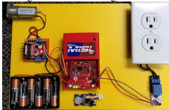
Figure 5. Integrated System Driven by TI LaunchPad

Using these IoT resources, teachers were able to develop Energia software that linked the LaunchPad and its resources to the Cayenne Broker, Publish environmental data to the Broker and then Subscribe to the Broker to downlink control information for their Kits. During the first week, the PD workshop teachers built a complete IoT system that implemented building monitoring and energy management while integrating the engineering design process and 3D printing.