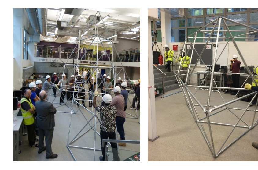
Figure 6: Structures assembled by two groups of MSc students in the academic year 2015-16. The present paper is based on the data collected from these two groups. Left figure: A 4.5 m high triangular based pyramid. Right figure: A fully triangulated minimal structure/sculpture.

The collected data from two groups of nineteen MSc students participated in the Project in the academic year 2015-16 will be discussed in the next section. Also, pictures of the two structures assembled by the participants are shown in Figure 6. Moreover, the participants have been asked to give consent to disseminate the findings from the feedback provided and an attempt was made to maintain the anonymity of the participants whose feedback is being used in the research.