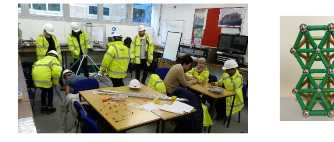
Figure 4: DAD Project group meeting in the teaching lab. Left figure: A group of students designing their structure and examining the practicality of the design. Right figure: An example of a small scale structural model with magnetic bars and steel balls.

Later in the Project, each group has 2-3 hours to assemble and dismantle their structure,