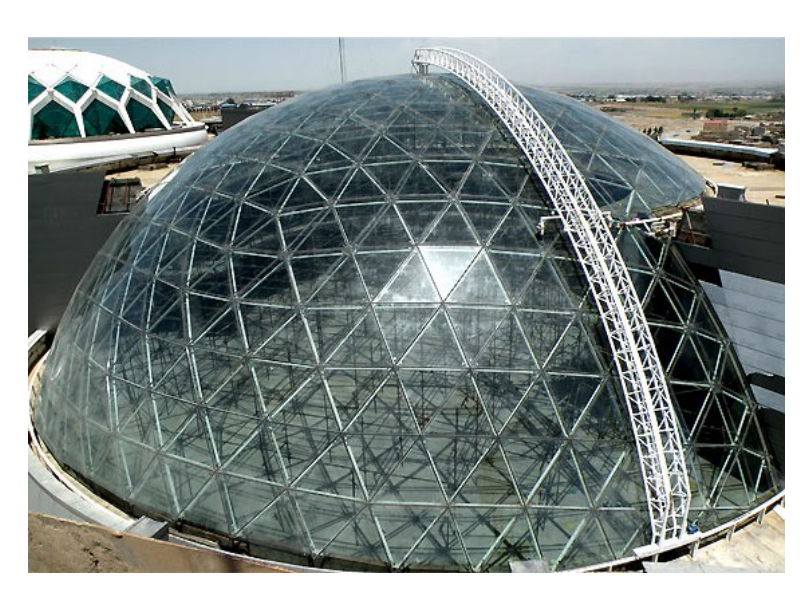
Figure 1: A geodesic dome with glass cladding having around 40 m span designed and constructed by ArchiVision Company in Mashhad, Iran <sup>1</sup>.