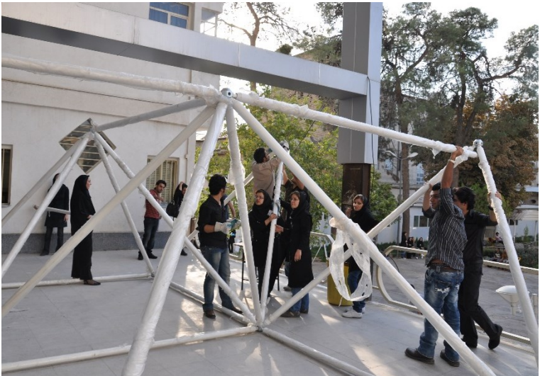
Figure 2: A group of participants assembling a full-scale prefabricated lattice structure as a part of a two-day course on design and construction of spatial structures organised by ArchiVision Company in Shiraz, Iran<sup>1</sup>.