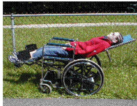
Figure 4 Prototype in Reclined Position