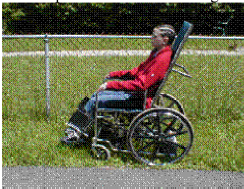
Figure 3 Prototype in Upright Position

The following pictures (Fig3&4) show the two extreme positions of the wheelchair with a user in it. The wheelchair can also rest in any position along the motion path to provide the user with the added benefit of changes in sitting positions throughout the day. In addition, the height of the seat from the ground can range from 21 to 26 inches. Most health care professionals used a height of 24.5 in.