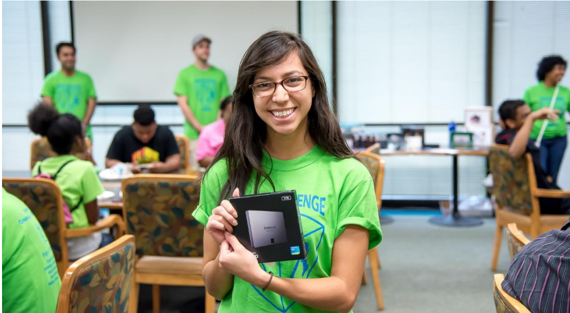
Figure 1: A student receives an SSD as a prize in the 2017 STEM Challenge.

The challenge was open to all high school and undergraduate students. Students from many high schools, community colleges and universities were represented at the event. It consisted of two levels of competition, with all teams showcasing their capabilities in several areas ranging from creative abilities, engineering design abilities, math abilities to software design abilities. A total of 29 teams (19 beginner teams and 10 advanced teams) registered for the event. Each team consisted of a maximum of 4 members.