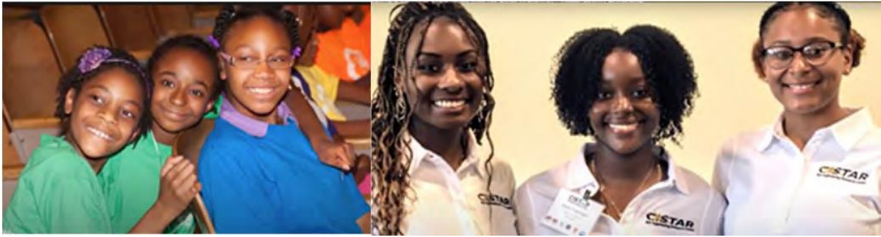
Figure 4: Having mentors, such as these three REM students, introduce engineering-related projects to SEEK kids, helps these kids imagine themselves as engineering professionals when they grow up.

In SEEK, REM students are exposed to the larger NSBE ecosystem through returning staff, teachers, and industry professionals that reinforce the message of Black engineers as normative and successful. In addition, the REM students have many mentors and opportunities to grow professionally during their time as SEEK mentors. As will be discussed later in the mentoring and learning stage, they interact with other peers who are often engineers, STEM teachers and business professionals, as well as NSBE members, all of whom mentor the REM students in the course of engaging with the SEEK kids.