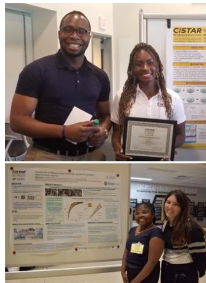
Figure 3: CISTAR mentors with their REM mentees by their research posters.

All parties adhere to a mentorship model to help the REM students grow into their research and other professional skills, as well as to build their confidence as engineers. The mentors know that for many of these students, and consistent with NSF REM goals, it is often the REM student’s first research experience, making it vitally important to nurture their emerging identities as engineering researchers.