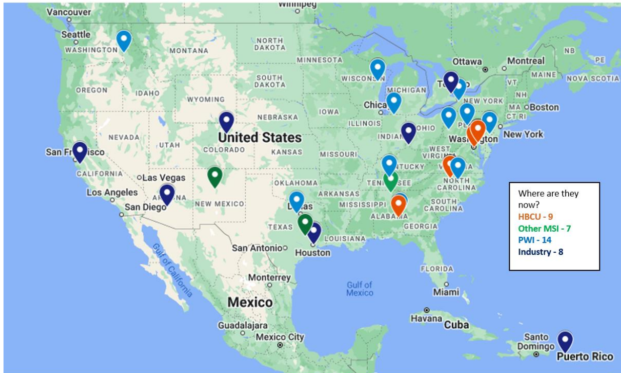
Figure 10: Representing the location of former REM students from across the country from the four years that CISTAR and NSBE SEEK have been partnering; see the legend for the color-coding details.

The legend of the figure also shows the types of institutions that the REM students are from; specifically, 24% at HBCUs, 18% at Other MSIs, and 37% at PWIs, 14% now in a PhD program. In addition, 21% of these former REM students have graduated and have an industry job, and several of them are working in companies in the energy sector.