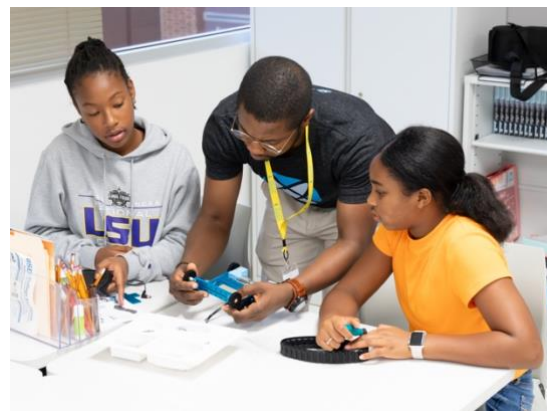
Figure 6: NSBE SEEK students watch what their NSBE SEEK mentor is building in preparation for doing it themselves next.

In addition, each of the teaching modules have a social justice component that challenges the SEEK students to imagine ways they can solve problems in their community through technologies like drones, coding, and robotics. SEEK Engineering Design Challenges incorporate elements of social justice by allowing the SEEK students to reimagine these engineering kits on drones, coding, and robotics as vehicles of change and means of problem-solving. Throughout, SEEK mentors ask the SEEK students to think of issues or problems facing their communities and then help the students apply their newfound knowledge and imagination to tackle these challenges and present real-world solutions.