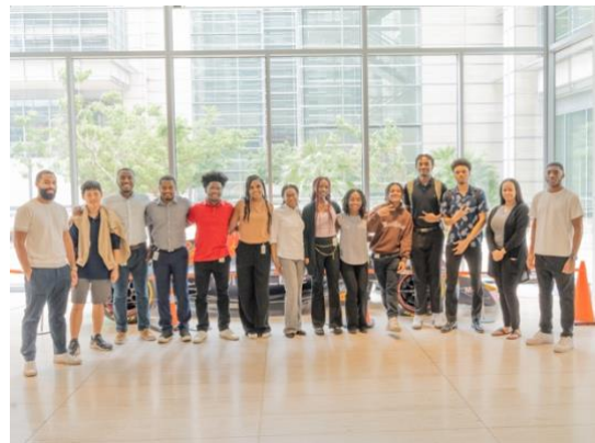
Figure 9: NSBE mentors get to know each other well, and many come back the following summer.

While the focus of the NSBE SEEK program is largely concerned with how to keep in touch with the NSBE SEEK students , many of whom will return to participate in the camp the following summer, we’ve had several of the SEEK mentors already saying that they will return as mentors or leaders next year (see Figure 9)! At the end of the 4-weeks, too, there are several SEEK staff/mentor appreciation events. Each site director holds a fun event to send off, celebrate, and thank everyone; often the parents or corporate sponsors throw a party, as well. As with the above CISTAR culminating experience, all of these NSBE SEEK culminating experiences serve to reinforce the REM students’ sense of belonging and identifying as an engineer, as well as support their altruistic cultural values, which is why many of them choose the REM program in the first place.