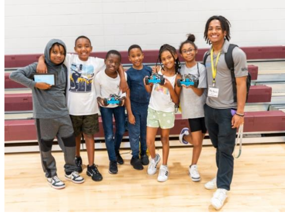
Figure 7: The comradery between the SEEK students and their SEEK mentor is evident.

The SEEK program has tried to build a culture of support and intentionality for all its participants, which is seen in the personal relationships this program develops and sustains (see Figure 7). During the program, SEEK mentors can connect with program stakeholders, such as corporate sponsors, community members, or NSBE members, who all very much want to see them succeed. Our diverse corporate sponsors frequently belong to Employee Resource Groups in large companies. They can reflect and give insight to the SEEK mentors on their professional experiences and help shape their engineering identity.