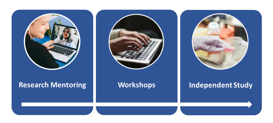
Figure 1: New support network components of the Research Scholars Program.