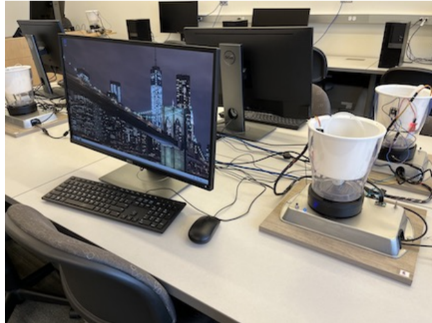
Figure 3: Lab stations with smart flower pot. Each station is shared by two student during the lectures for modules 2-4.

learning and confidence in Python programming. At the end of each course module, students completed a quiz containing exercises similar to the assigned practice problems and a survey to gather students' perceptions of their own learning and feedback on the course delivery.