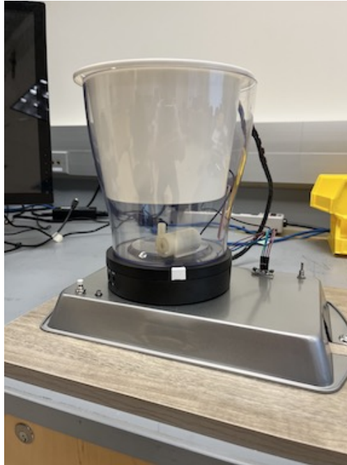
Figure 1: Smart flower pot. It can connect to a cloud service to retrieve 5-day weather forecast for the location of the pot, measure various things using its sensors and adjust its actions based on the forecast to periodically rotate the plant and deliver just the right amount of water to keep it alive.

used as the PjBL platform to deliver the instructional content (modules 1-4) of the new course.