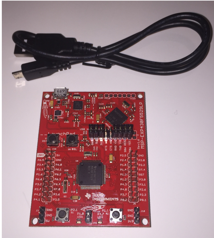
Figure 1. MSP430 Launchpad Evaluation Kit