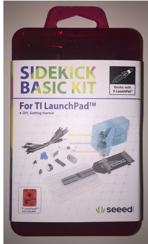
Figure 2. Sidekick Basic Kit