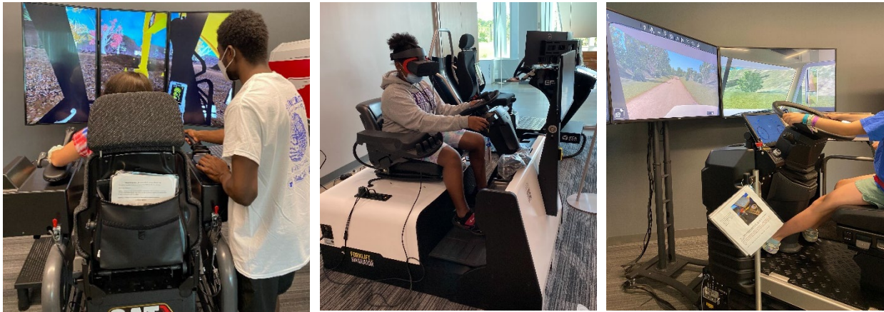
Figure 1. (Left) A participant been assisted through a lesson on the CAT Excavator Simulator, (Middle) Participant completing a Forklift Simulator lesson, (Right) Participant using the truck driving simulator to complete a custom skill task.

simulators. This module's time is dependent on the number of simulators available. For a group of 25 students with access to four simulators, the activity took approximately 40 minutes.