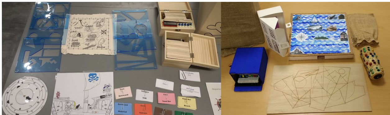
Figure 1 - Two examples of Tabletop Escape Room projects created by students. The groups used acrylic, wood, and laminated paper to create polished projects. (Left) The players are trapped on an island and must traverse a cave and steal a pirate ship to escape. (Right) The players are on a luxury cruise when their boat starts to sink. They must escape from the vessel before drowning.

Escape rooms created by the small groups differed vastly, as students have contrasting creative design ideas. Figure 1 shows two different Tabletop Escape Room projects. Each project has the same requirements, milestones, and rubrics, but vastly different final products.