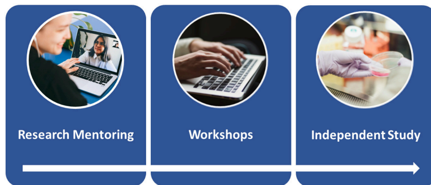
Figure 1: Support network components of the Research Scholars Program.

develop an extensive support network for students that covers mentoring, workshops, and a guided independent study course. This paper summarizes the creation and implementation of the support network and provides two examples of student research projects.