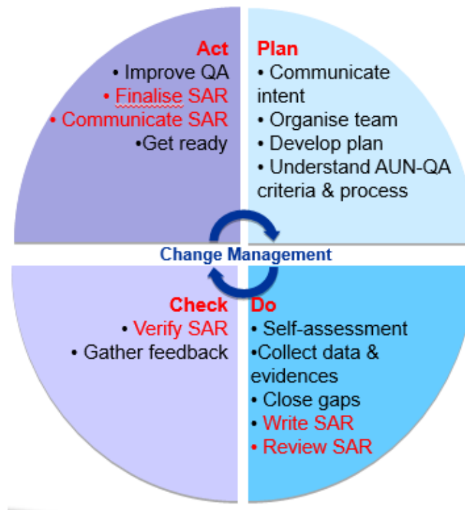
Figure 2. AUN-QA Approach to Self-assessment at Program Level 8

In comparison, AUN-QA seeks to create viable internal quality assurance (IQA) systems within ASEAN universities. The primary focus of AUN-QA assessment at the program level (there are initial efforts underway towards doing institutional level evaluations) is for the purpose of improving the effectiveness of the quality assurance system. AUN-QA has adopted the Plan - Do - Check - Act (PDCA) approach for improving QA practices, as shown in figure 2. 8 Thus, AUN-QA accreditation is more system and process-oriented. Student attainment of outcomes related to what students "know and can do" is not a focus. 9