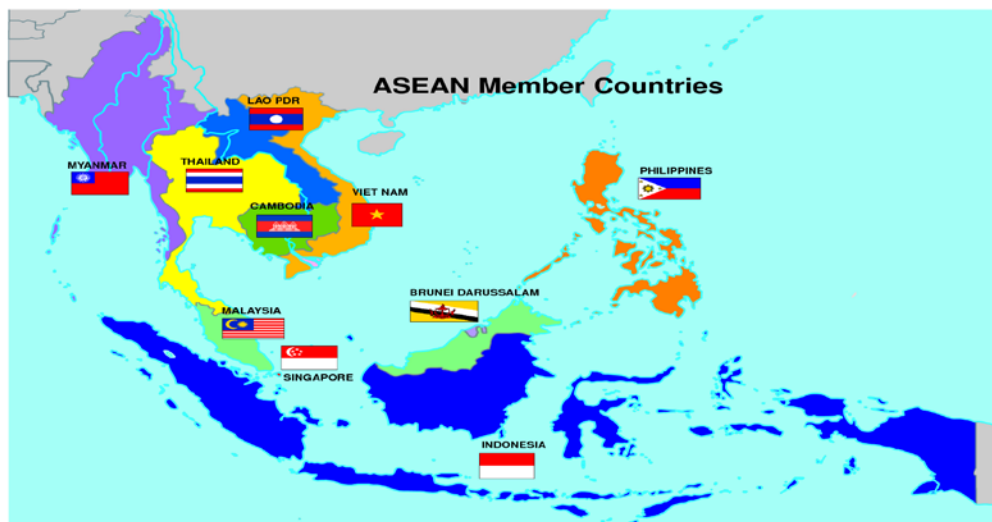
Figure 1. ASEAN Countries 6

On the other hand, the AUN is a network of universities in ASEAN countries, established to promote higher education cooperation in the ASEAN community. Each university must become a member, initially at the associate level, of the AUN system in order to pursue program accreditation and, at this point, only universities are offered membership. Evaluators are nominated, either by self-nomination or by institution, with no requirement to represent a specific discipline. Also, to date, no two- or three-year programs have been accredited by AUN-QA. There is no internal sub-division of programmatic responsibility and there is only one set of accreditation criteria. All programs are evaluated against the one set of criteria and programs from any discipline can be accredited. The results of an evaluation fall upon a scale between one and seven. Overall scores above a four allow recognition as an accredited program. AUN-QA only accredits programs from member universities within the ten country ASEAN community (see figure 1).