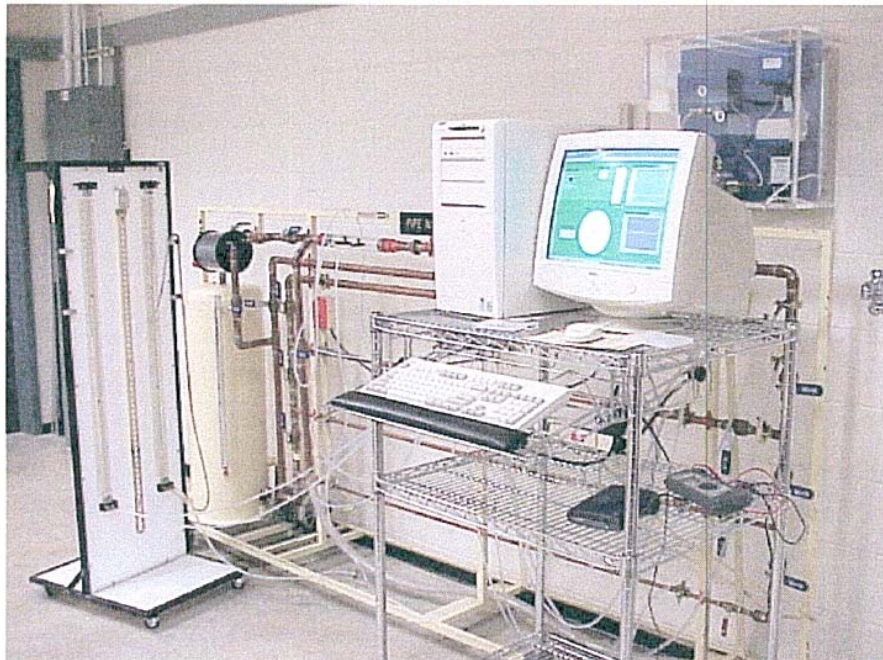
Figure 2: Modified Piping System Diagram