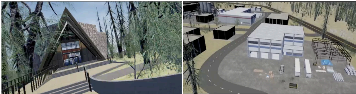
Figure 3. Facility-level VR models developed for the course. The image on the left shows the facility-level model for the fission facility. The image on the right shows the facility-level model for the fusion energy facility.

A second set of models are facility-level models (as shown in Figure 3) set up as first-person player video games. Students exploring these models can walk around the entire energy facility, explore the layout, and develop an understanding of how the facility fits into its surroundings.