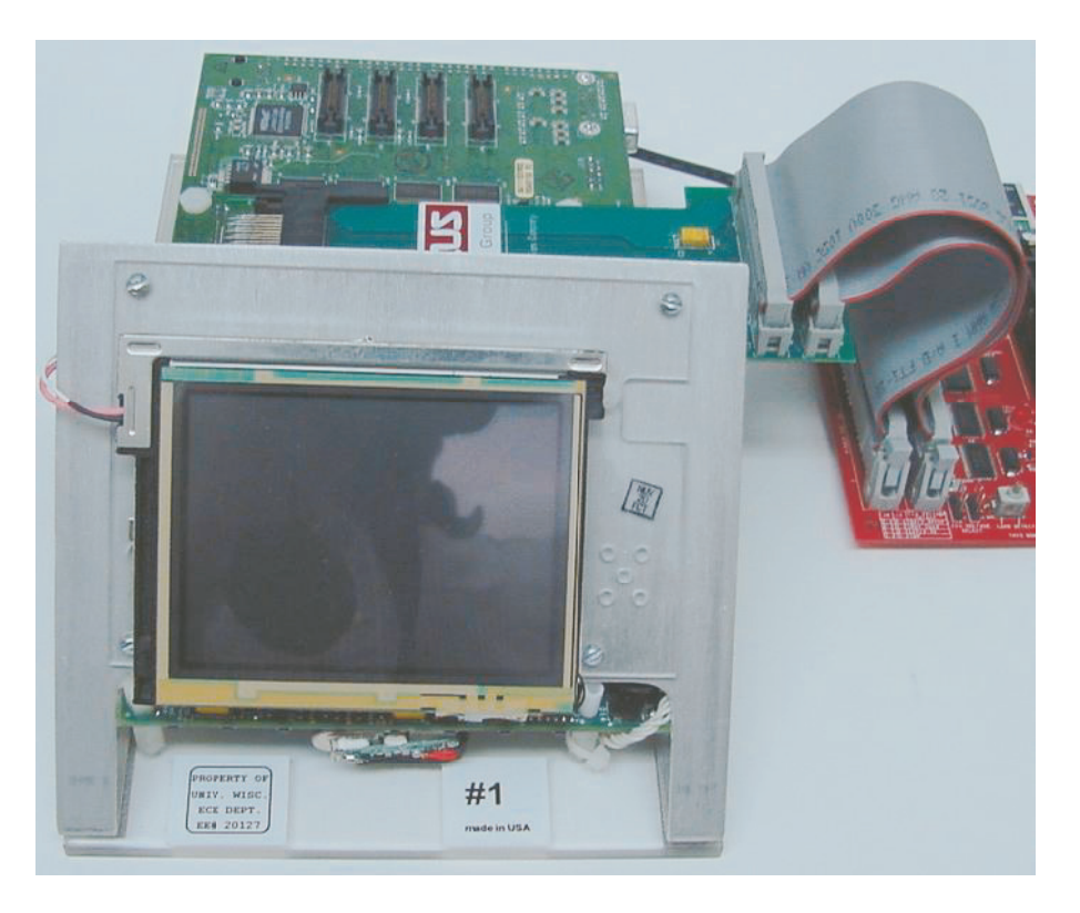
Figure 1: Photograph of the StrongARM board set (front view).

students on a given expert team will become experts on some particular area of interest, prepare a presentation, and then be available to assist other students in that area. In the past, this has been commonly used to create pockets of expertise in specific areas of interest, such as device drivers, MFC graphical elements, and the like. In addition to providing multiple sources of expertise within the class, this also mimics common industry practice where individual engineers often have an assigned (or developed) specialization in addition to their more general project work.