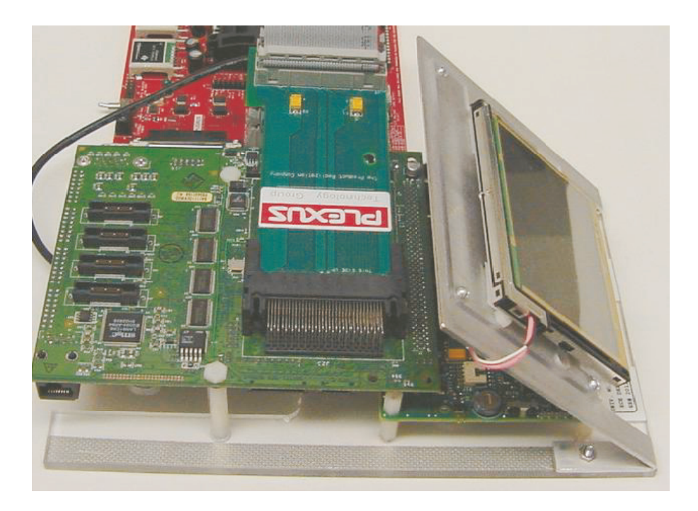
Figure 2: Photograph of the StrongARM board set (side view).

functional evaluation boards so that they are able to design further functionality into their system. The drawback to this method is that students are limited to relatively simple interfaces (both the user interface and the electrical interface), and to using parts that can be hand-assembled. Also, if students freely choose their own processor, obtaining and managing development tool licensing and support is often problematic at best. Our goal was to include state of the art hardware (such as the StrongARM microprocessor) and provide robust tool support, but still retain for students the essential elements of low-level design and fabrication.