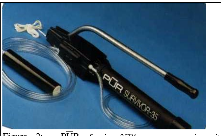
Figure 2: P\overline{U}R Survivor-35<sup>TM</sup> reverse osmosis unit.

The Survivor units incorporate a spiral wound membrane into a small pressure housing. The spiral wound is one of