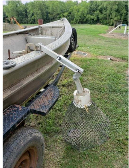
Figure 1. Trap Lifter on Boat

farmers could quickly use the mechanism efficiently. The farmers would need to see a quick return on their investments like a reduction in soreness that is currently felt daily. The assembly to their boats needed to be simple so they do not have to modify their existing equipment too much. Simple mechanical parts with no hydraulic, pneumatic, or electronic components minimized break down issues of the mechanism. The material required for the mechanism had to be light weight not to add too much extra weight in the boat which could cause unnecessary wear and tear on the boats' motors and to the ponds. Extra weight in the boat would cause deeper ruts in the ponds and in turn cost the farmer more money after the season to rework his pond 6 . The material also could not cause damage to the traps. The mechanism needed to mount and operate in a way that would not be intrusive to the farmers' work of emptying the trap, rebaiting it, and replacing it into the water. The design process included research, interviews, analyzing concepts to determine the best design, building and testing the prototype, and analyzing data collected.