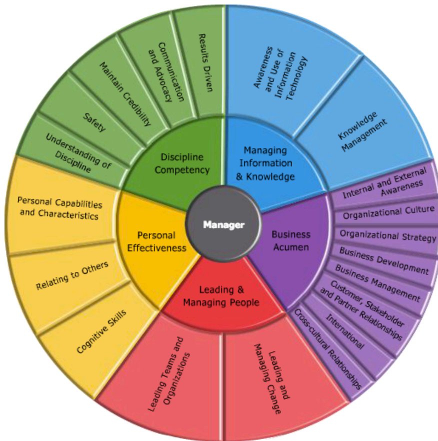
Figure 2. NASA Leadership Model for Managers. [13]

The need for detailed rubrics also extends past the hiring process to the promotion of engineers. A lack of clearly defined behavior traits can make it difficult for supervisors to acknowledge progress of an employee, and for employees to keep track of their growth in a company. For example, Figure 2 below displays NASA’s leadership model for managers [13] . The official website and PDF handout of this leadership model provides detailed definitions of each desired trait (each of which is commendable) but fails to define quality levels of performance for the best of worst examples of demonstrating a trait. This allows for vague feedback to be given during performance reviews, and can be cause for misunderstandings about behavior between supervisors and employees. Behavior that is viewed as ‘assertive’ and ‘leader-like’ by men is often construed as ‘aggressive’ and ‘bossy’ when exhibited by women [14] ; detailed rubrics may assist in clearing up gender and race biases by allowing employees to explain behaviors in the context of the rubric and clarify potentially negative stereotypes. When rubrics are constructed and evaluated by employees in collaboration with managers, they can also be used as a learning tool, as employees must reflect on their professional skill development.