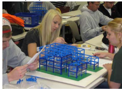
Figure 1. Student Construction

Student groups then procured the materials (i.e., the parts that they requested for the Tektōn Hotel Plaza project) based on their quantity estimate. Actual construction followed with inspections by the course instructor (Figure 2). Once approximately 50% of the construction was complete a “change order” was issued. Student groups performed the necessary take-off estimates and additional materials for the change order were procured. Once construction was complete, the building was formally delivered to the owner. At the end of the life-cycle of the building, it was demolished and recycled. A Final Project Report was then submitted by each individual.