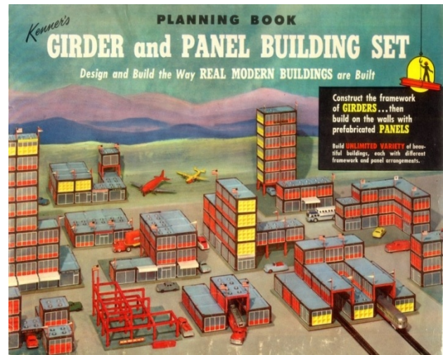
Figure 3 Girder and Panel Building Set (1950's)