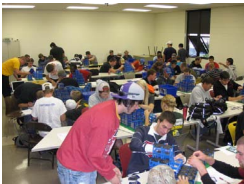
Figure 2. Group Work

The highlighted assignments are those related to the Tektōn Hotel Plaza project and included the ten (10) phases of construction management as described in Appendix B. Assignment 2 - Materials Estimate incorporated Phase I (Construction Documents and Codes) and Phase II (Estimating). Assignment 4 - Work-Breakdown Structure and Time Estimates integrated Phase III (Scheduling) and Phase IV (Procurement and Delivery). Assignment 7 - Change Order focused on Phase V (Construction), Phase VI (Inspections), and Phase VII (Change Orders). Assignment 8 - Final Project Report included Phase VIII (Project Delivery), Phase IX (Demolition), and Phase X (Final Project Report).