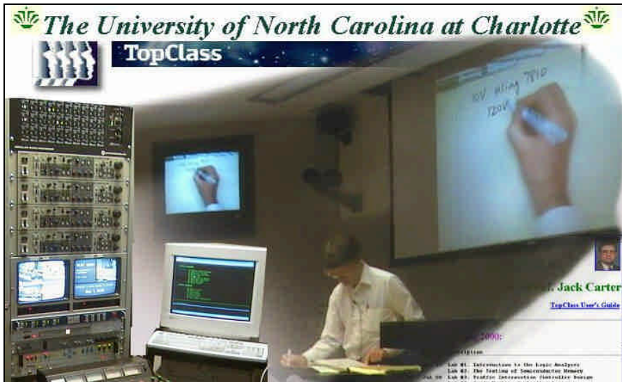
Figure 2: Faculty Member using 2-Way Interactive Television

The University's Distance Education Office now employs a staff of instructional technology consultants who train Engineering Technology faculty in online course design and in the use of WebCT. An initial two-week workshop is offered in a hybrid, traditional and online, format and allows the faculty a chance to participate in a web-based course as the student and a course designer. It is helpful for faculty to experience the course from a student's perspective so that they develop a course being fully aware of the problems that students may encounter.