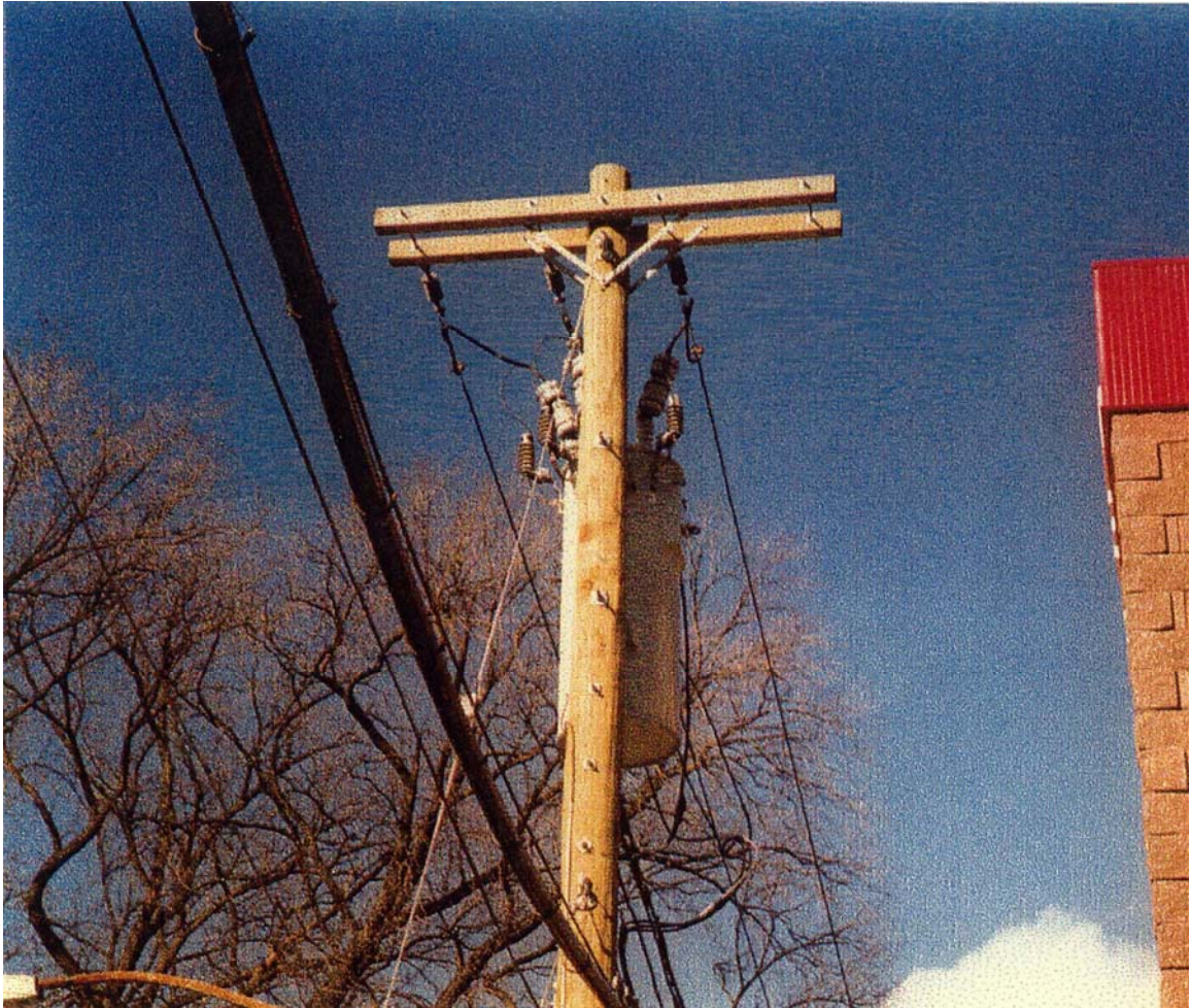
Figure 2: Telephone pole with 3-phase 13,000 Volt power cable near building (right) where accident occurred.