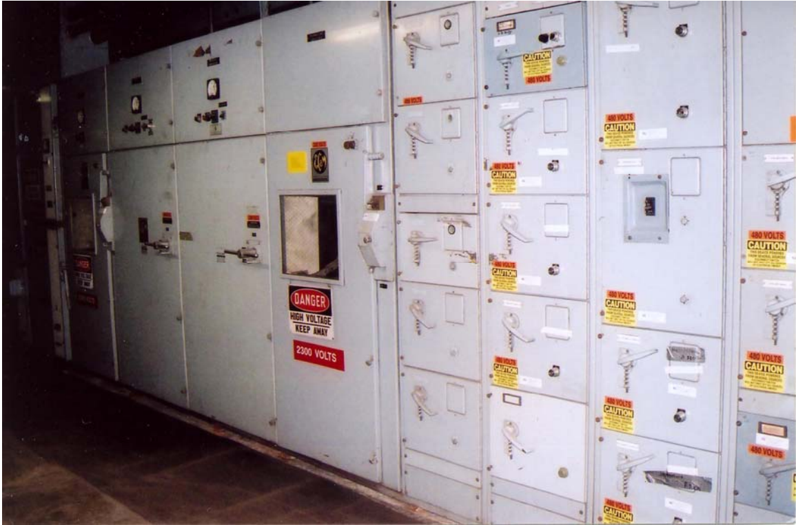
Figure 4: A sampling of the more than 300 electrical closets at a very large food warehouse in New Jersey.