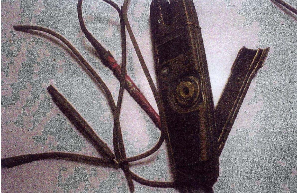
Figure 3: Bright yellow fluke multi-meter is badly blackened (burnt) out a result of measuring 4000 Volts.