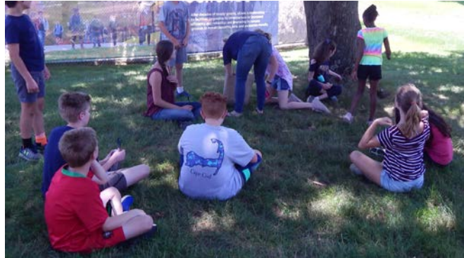
Figure 3. View of participants during round table discussion.

experiences in school allowed the participants to be comfortable with talking about their experiences with their peers. These discussions help participants to understand that they are not alone in their experiences and provide an opportunity for relationship building among participants and mentors alike.