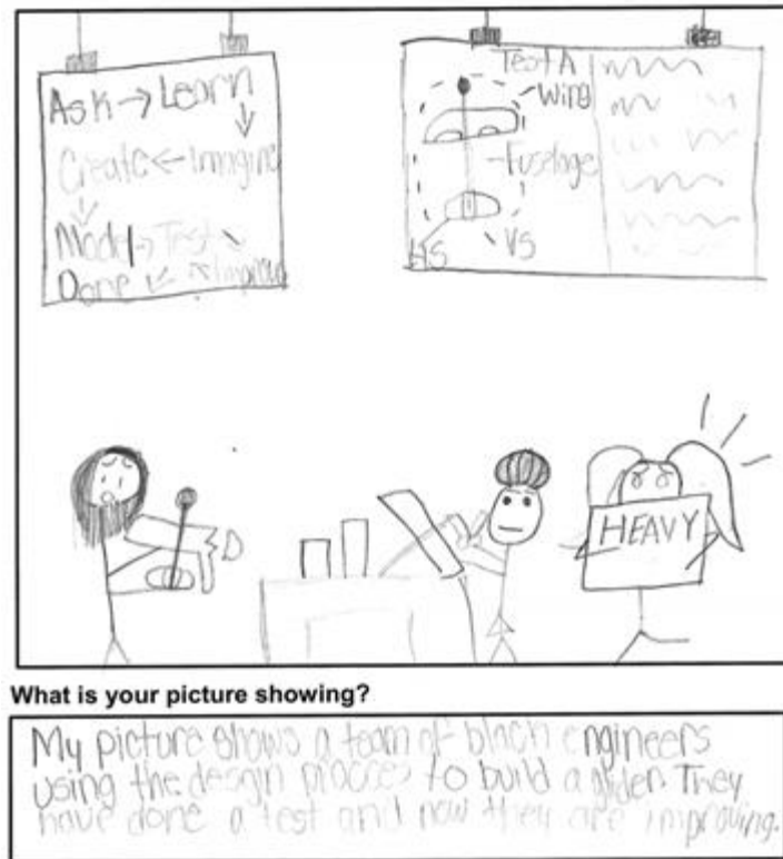
Figure 3. Transcription: My picture shows a team of black engineers using the design process to build a glider. They have done a test and now they are improving

Overall, children’s’ drawings and descriptions of gender and race provide insights into what the children consider engineering is and who an engineer can be. In future work, we plan to analyze how summer STEM programs, such as SEEK, influence the images and messages around attributes that engineers hold and narratives around what those current messages are by closely examining pre- and post-drawing differences.