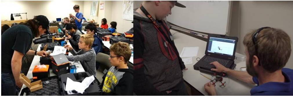
Figure 5: Drone camp build/test activities.