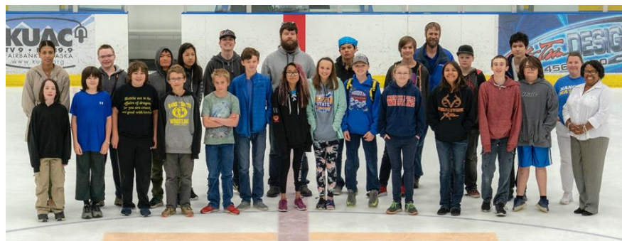
Figure 3: Drone camp participants.

By the end of the camp, the students had learned to build and safely operate their small racing drone and demonstrated those skills in a friendly race at the Patty Ice Center against fellow classmates. When camp came to a close the students were able to return home with the systems that they had assembled and learned about during camp; thus, giving them an opportunity to further practice their new skill set. In the following weeks and months, several students returned to UAF to have ACUASI personnel help them repair their vehicles. The ACUASI team set up a longer-term open-door policy for these students to return with questions and for repairs. This was exciting because it proved the students were using their aircraft regularly. They also learned about FAA rules and regulations, UAS safety, aerodynamics of flight, teamwork, and other important skills needed for careers involving UAS.