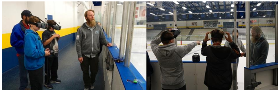
Figure 2: Drone camp flights.

During the remaining 3 days of the camp, the students were in the classroom setting in the morning finishing any last-minute builds and practicing on the simulator. In the afternoon, after a short walk to the Patty Ice Center on campus, the students were able to fly and race against one another within the ice rink through a short course. It was during this period that the UAF team discovered some issues with the aircraft flight battery’s specification and the lack of ability to provide sufficient power to maintain flight above low altitudes within ground effect of the propellers. However, new batteries were purchased from a local hobby store and the students were able to fly their own aircraft through a fun, eclectic course comprised of soccer field markers, tires, hockey goals, and hula-hoops.