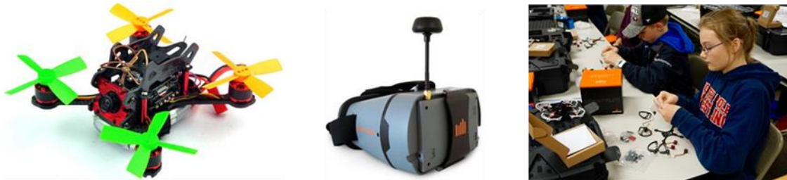
Figure 1: Eachine Firer 100 (left), FPV headset (middle), student building drone kit (right).

The drone model used for the summer camp was the Eachine Firer 110 [7]. The aircraft is made of mostly carbon fiber that measures 110 millimeters crosswise from motor to motor. It is controlled by an Eachine F3 Minicube Flytower compatible with Spektrum, Flysky and Frsky. The aircraft are also outfitted with an Eachine TX05 Mini First-Person View (FPV) Camera. The camera system is capable of providing near real time analog video back to the pilot while also providing some limited aircraft information through an On-Screen Display (OSD) within the Spektrum 4.3” FPV headset/monitor.