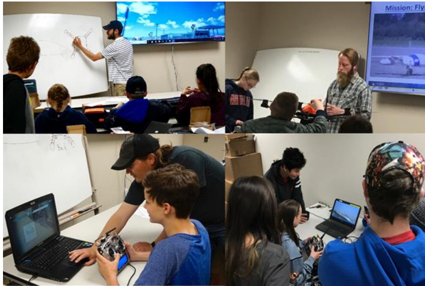
Figure 4: Drone camp classroom activities.