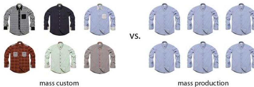
Figure 2: Mass customization in the fashion industry 17

Mass customization manufacturing systems are designed to enable personal approach to products and services 15 . They have to be designed carefully with real customer needs in mind, with not too many options which customers might sometimes find overwhelming. Online research methods such as data mining are used extensively to access consumer information and gather data which can be used to enable easier customization which would really fit the customer 16 . This kind of design approach is used in both, the fashion industry and engineering. Customers are looking for more product excitors than ever before and sometimes having something which they can adapt to their own personal habits may be the reason to make a purchasing decision or not. In addition, mass customization strategies, as shown in Figure 2, generate more sustainable products at lower cost and increased value 17 and increased value to the customer 18 .