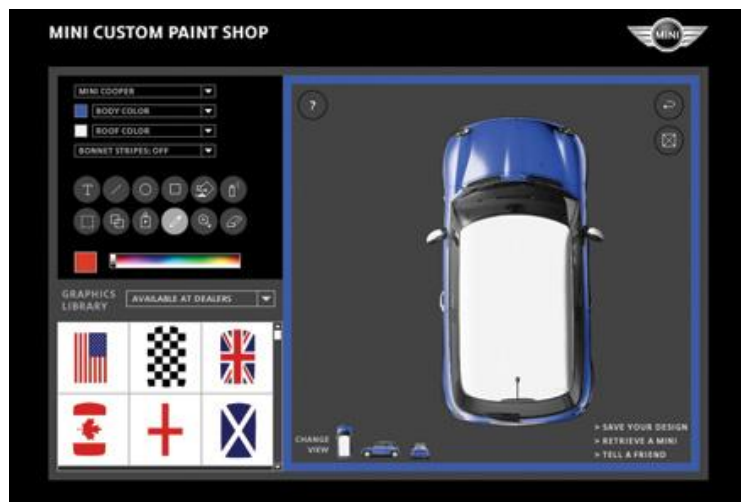
Figure 3. Personalization of Mini Cooper's roof in an online tool 19

This kind of perspective is very well known to fashion students, but in engineering curriculum it is not emphasized in a great extent. . Considering that mass customization and personalization is becoming a norm in several industries, for example the automotive industry as shown in Figure 3 Mini Cooper customers can chose design of their roofs with an online design tool 19 . Therefore, it would be beneficial to develop a course which would include these topics and would deal with engineering design theory embedded in fashion topics. In engineering terms, the project would include topics such as House of Quality, Group Technology, Parametric Design, Product Family, Bills of Materials, Bills of Manufacturing, flexible manufacturing and flexible assembly systems. Determining manufacturing as a flexible and fluid process which is adaptable to constant changes that are influenced by customer's opinion is one of the soft skills needed by industry of today