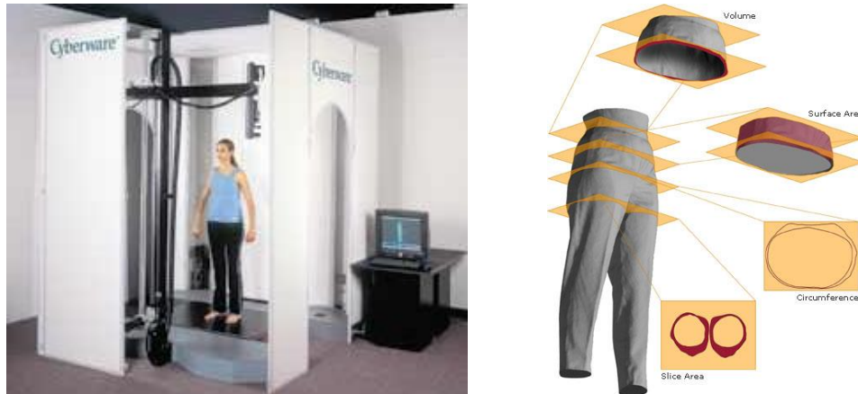
Figure 1: Application of 3D body scanners in fashion industry 14

developing a sizing system for clothing industry with a body scan technology was based on a software which was originally developed for the automotive industry, where 3D scanning is extensively used in design. Hence, if engineering students would have a project which would involve scanning their own bodies and developing a sizing system, not only that they would learn more about reverse engineering, but they would learn about technologies which are used in other industries which involve products with complex surfaces such as automotive, aerospace and defense.