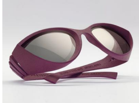
Figure 4: Rapid prototyping with Maker bot and a fashion item build with 3D printing 27,28