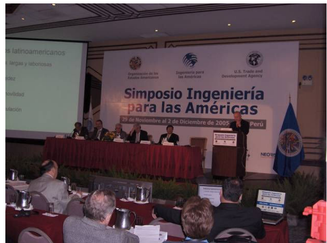
Figure 2 EFTA Symposium, Lima Nov-Dec 2005

The Engineering for the Americas movement continues to grow and expand, and plans are being developed by the partnership to facilitate and finance regional and country activities that begin to enhance engineering education and create quality assurance mechanisms.