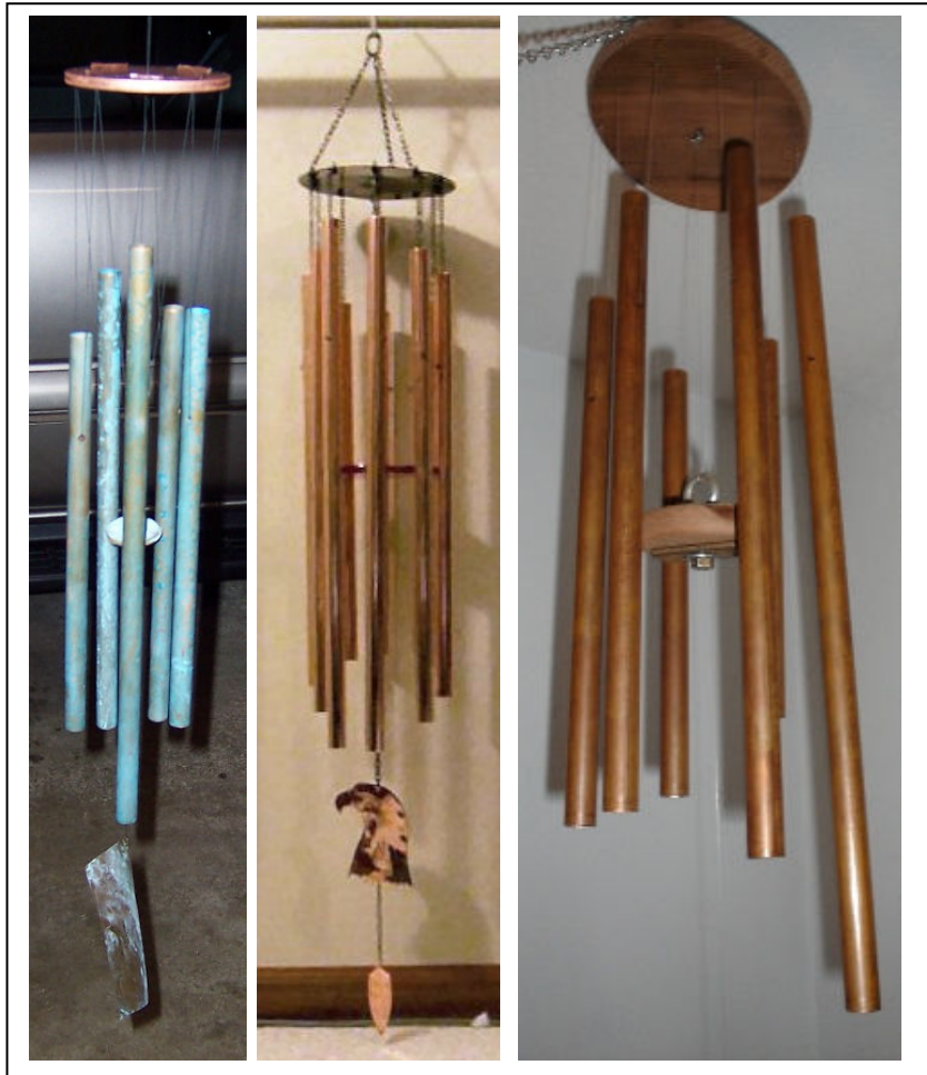
Figure 2: Three examples of student wind chimes. All three of these chimes are made using copper tubing. The picture on the right shows a typical basic set of chimes. In the middle picture there are two chimes for each note and some very detailed work on the sail. The left hand set of chimes had a chemically accelerated patina.

There were also unique aspects to each group's design process. Some groups identified and used additional web resources (some of which were included in the earlier section). One group chose to use an alternative sound recorder to get better wave files. One group developed a temporary pinch hanger made from a large hinge to allow them to test the tuning of their chimes without drilling a support hole. Most groups used CAD or solid modeling programs to lay out the top support and set the spacing of the chimes and used some software tools to carry out the repeated calculations with equation 1. These included Excel spreadsheets, MATLAB functions and MATHCAD worksheets. Many groups tested alternative sail and hammer designs to gain their desired result.