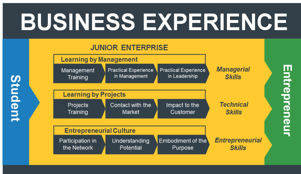
Figure 2. JE Student Development Model

As a company managed only by students, they need to take initiatives and be proactive in order to succeed. Therefore, this experience serves as a laboratory for real market situations where each student needs to develop critical soft skills and technical skills. Every JE has a hierarchy that gives the student the opportunity to gain experience. For example, manage meetings, set department goals, and have contact with real customers while performing real projects related to their field of study. The flow map in Figure 2 shows how the students develop lifelong learning skills and become an entrepreneur with highly developed skills.