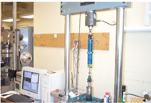
Figure 3 Shock absorber test setup.