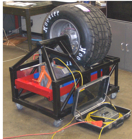
Figure 5 Tire test set up.