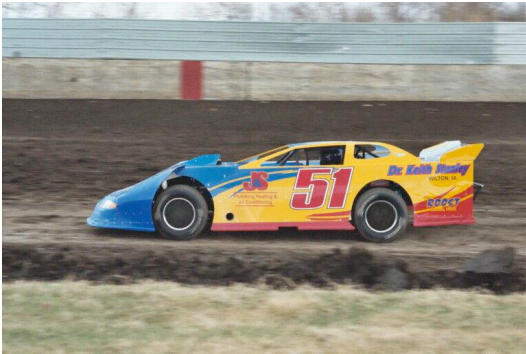
Figure 2 Matt Furman's number 51 NASCAR late model racecar on the track.