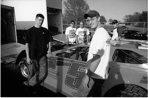
Figure 1 Mechanical engineering students involved in professional dirt track auto racing.