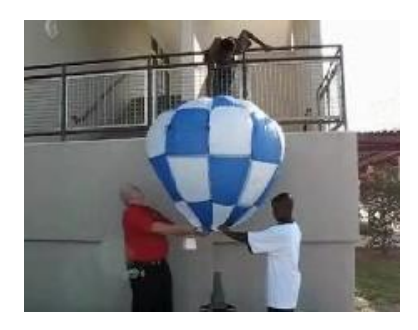
Figure 3. A Middleton aerospace tech student launches the hot-air balloon

accomplish tasks, like sweeping Lego blocks across a table. Then they compete against each other in two-minute matchups to see whose design and programming — and math skills — are the best<sup>6</sup>. One of the students launches a hot-air balloon he constructed with tissue paper (see Figure 3)