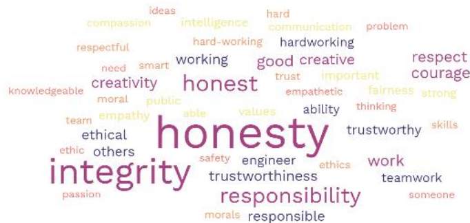
Figure 2. Word Cloud of Responses

When looking through the responses to the question “List three values you think are the most important for defining a good engineer”, some interesting trends emerge. The three most common values are honesty , integrity , and responsibility (see Figure 2).