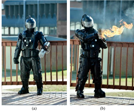
a) The project suit, and b) demonstration of firethrower.