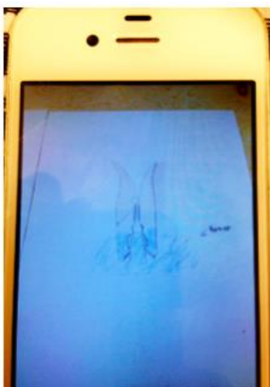
Figure 2. A photographed sketch during a study visit in technology subject.

Likewise, teachers also mention that students are used to photographing paper documents at school to transmit information home from school: “They document and take pictures, in order to bring it home. For example, when we distribute paper documents, they are taking pictures of them. In case they lose the paper, they still have it.” The teachers reported that students also can ask if they may take pictures of their drawings.