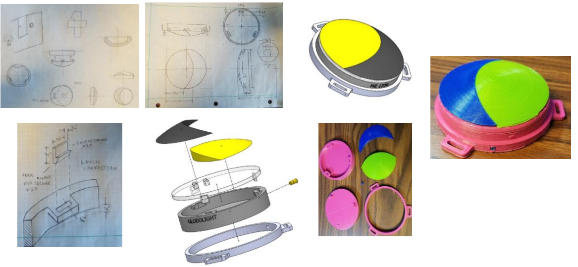
Figure 2: External representation designs-for-sustainability: Making the implicit information explicit (Sketching, CAD models and 3D printed parts and assembly)

In individual projects, students work on product designs with external representations promoting sustainable resource-use to motivate people to make decisions and commit to behaviors that sustain resources. In the project-description, students are asked to take the lead on designing creative and unique appliances that promote sustainable use of resources for Home & office use of our university community. Students are supposed to use creative ideation and sustainability design concepts introduced in the lectures and prepare a preliminary set of visualization sketches describing the sustainability design with external representation. After feedback and approval from the instructor, develop CAD models, working drawings and 3D print the parts. Figure 1 and 2 shows examples of student work on external representation designs. Students design project shown in Figure 1 (the toilet paper dispenser design) with external representations promotes