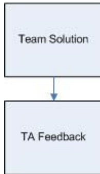
Figure 1 – Fall 2003 MEA Sequence

This approach was functional for two years before the research on MEAs necessitated a major redesign. By this point, MEAs has expanded from a single draft to a three iteration process, with the first and third iterations being evaluated by the TA and the second iteration being part of a double-blind peer review. Additionally, teams provided feedback to their peer reviews in the form of a short survey (termed the “Team Critique of MEA Critique by Peers”). Though the sequence had expanded, the contents of a given stage were still largely the same. The sequence is shown in Figure 2. The number of stages and the inclusion of both individual and team tasks necessitated moving from a single database table to multiple tables.