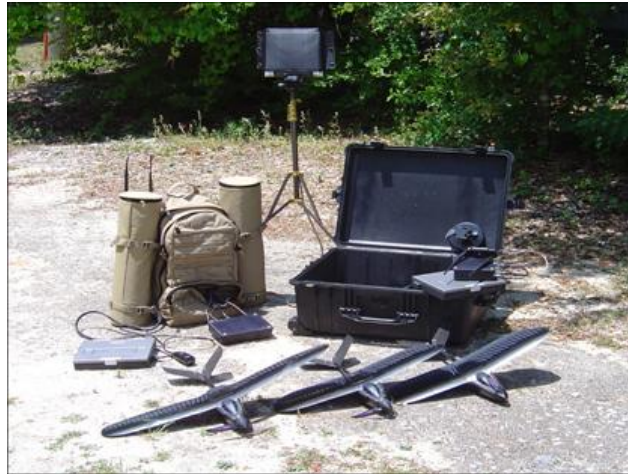
Figure 3. Equipment supporting Multi-UAV Research at AFIT

most notably software and/or computer engineering. Common themes among these hardware based UAV projects were the difficulties faced by SE and AE students in migrating research code (typically using MATLAB) onto the microcontrollers for flight test, or integrating new software modules with legacy modules written in dissimilar languages. Laboratory technician support could alleviate these problems, but surfaces another issue – resourcing interdisciplinary programs.