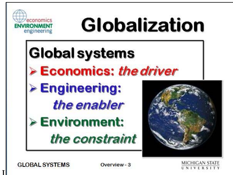
Figure 1. Global Systems: economic, engineering, and environmental.

The fourteen core topics that built the framework of globalization were: