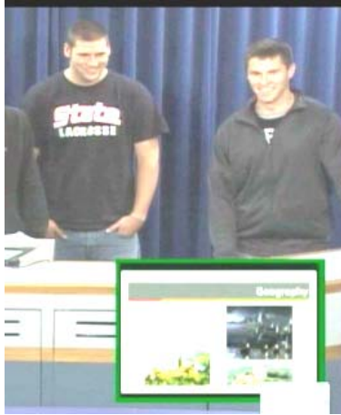
Figure 4: 11/23/10. Apparent is clear eye contact, great slide layout, and animation