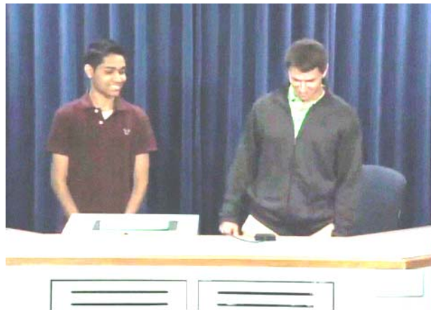
Figure 1: 9/14/10 This figure clearly shows me reading slides rather than explaining

“It is very hard to determine exactly what ( sic ) components separate a good presentation from a great presentation. After much thought, I have decided that presentation criteria should be divided into four broad categories: delivery, PowerPoint, organization, and preparation. ... (Presenters) should also be able to answer a wide variety of questions related to the topic. ... I implemented a grading scale from one to four, with four being the highest. ( i.e., best ) ... I chose to discuss four of my presentations. They all offered something different – whether it was team members, the audience I was presenting to, or the role I played in the group.” This student also used frames from recorded presentations to show how he had made progress with respect to various criteria.