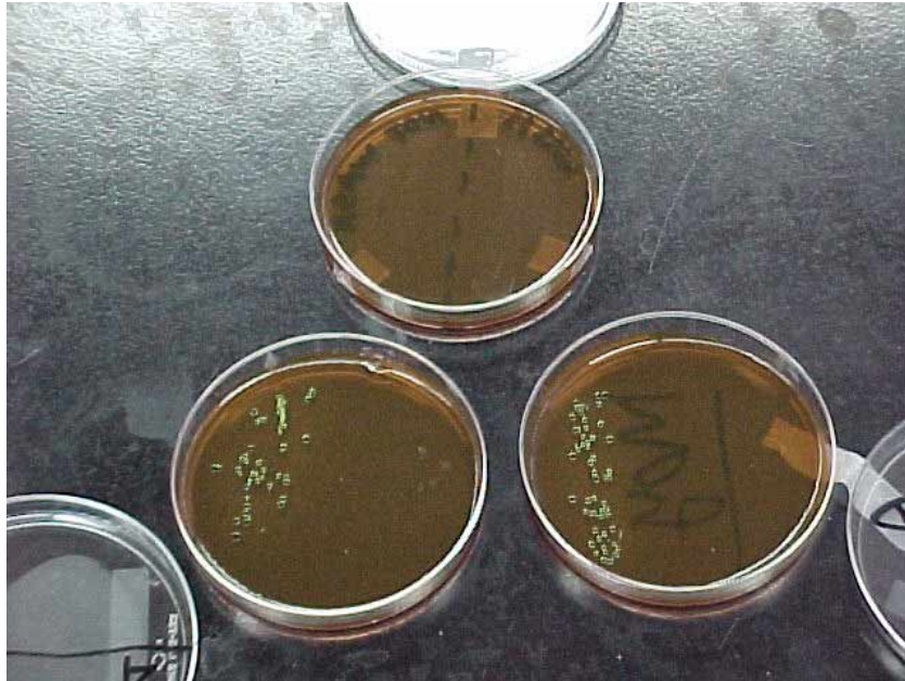
Figure 2. Typical Results of Effectiveness of Toilet Paper Project