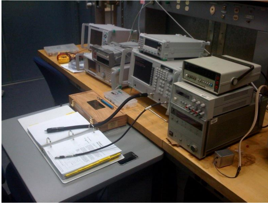
Figure 1. Microwave Test Bench Set-up

perform calibration and take s-parameter measurements on microwave components using the equipment provided.