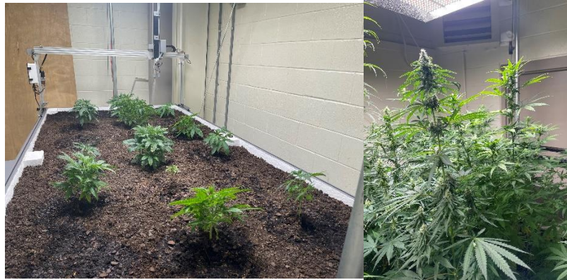
Figure 5. Hemp cultivation in indoor Farmbot

The project was designed to address both historical and contemporary social challenges faced by marginalized communities. Hemp cultivation on the FarmBot platform became a lens through which students could examine the potential economic, environmental, and social benefits of this versatile crop 18 . Figure 5 depicts hemp cultivation with indoor Farmbot.