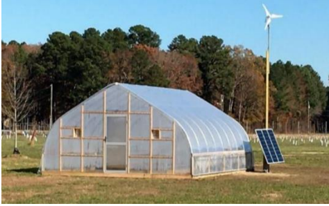
Figure 1a. Outdoor FarmBot set up in high tunnel solar and wind turbine