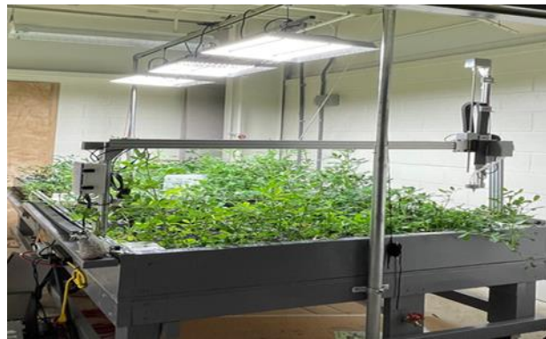
Figure 2. Indoor FarmBot with Growlights, the Farmbot bed is on a mobile table