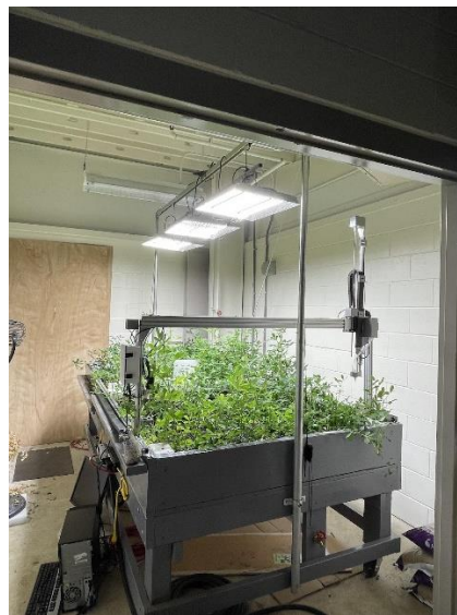
Figure 4. Peanut cultivation in indoor Farmbot

The historical legacy of peanuts is intricately intertwined with the pioneering contributions of George Washington Carver, an esteemed African-American scientist and educator. Revered as the "Father of the Peanut Industry," Carver's groundbreaking research and innovations have left an indelible mark on agricultural science. His legacy continues to inspire generations of students, researchers, and scientists to explore the boundless potential of peanuts and other crops, exemplifying the enduring impact of visionary scholarship 15 . The unique characteristics and historical significance of peanuts render them an invaluable subject for academic study and experimental inquiry, particularly within the educational milieu of historically black colleges and universities. As students engage with the multifaceted aspects of peanut cultivation, they not only enrich their understanding of agricultural science but also honor the legacy of trailblazing scholars like George Washington Carver. Figure 4 depicts peanut cultivation conducted with indoor Farmbot.