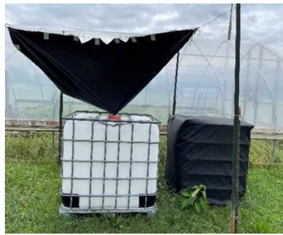
Figure 1c. Rainwater harvesting system