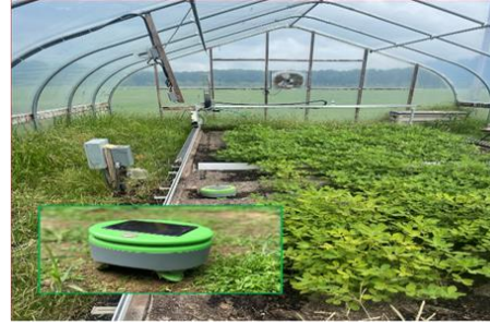
Figure 1b. View from inside of outdoor Farmbot with solar-powered robotic weeder