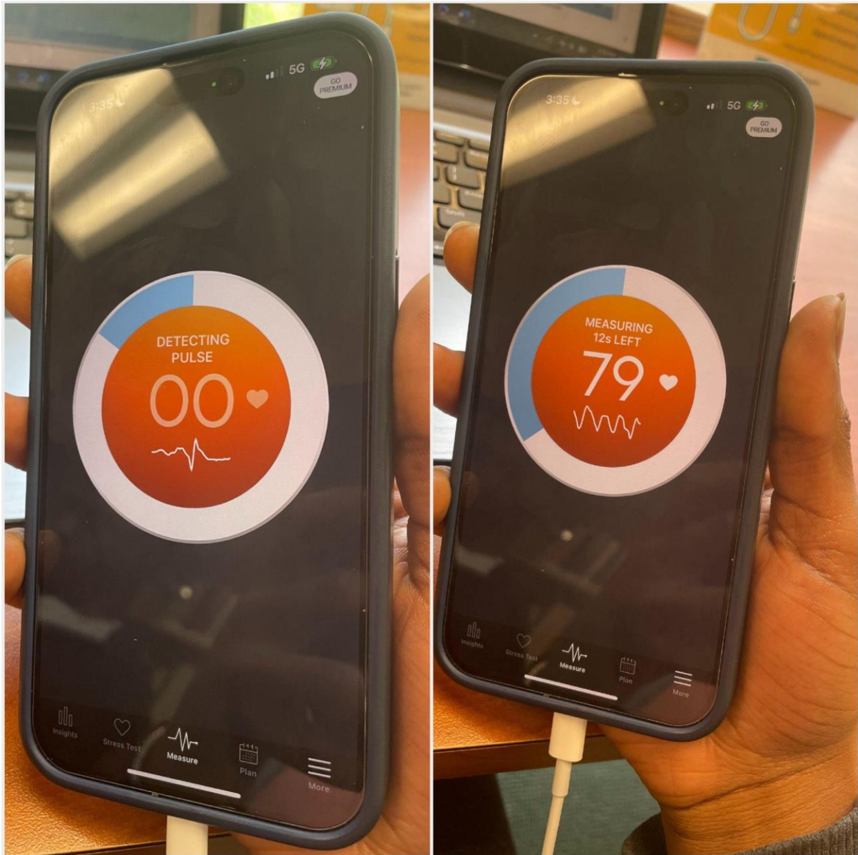
Fig 1: The Azumio App used to measure heart rate

The students were allowed to work on this assignment in groups; however, all students were required to submit an individual report.