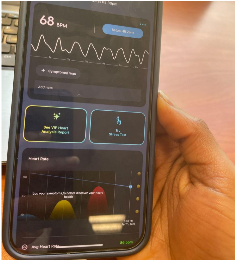
Fig 2: Result of the heart rate measurement in one of the experiments