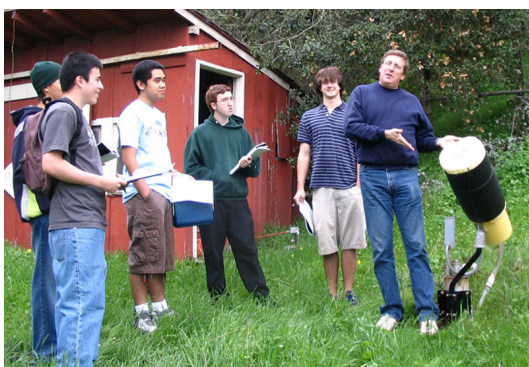
Figure 3. Service learning was accomplished by teams of freshmen that designed and built water purification systems powered by renewable energy for local families.

In our curriculum, we had the freshmen work in teams of four to five students to interface with a local family who uses well water. Their design challenge was to design and build a system that would bring the family's water up to drinking water quality standards and not require anything but renewable energy from their site (Figure 3). They were also given a number of other design constraints.