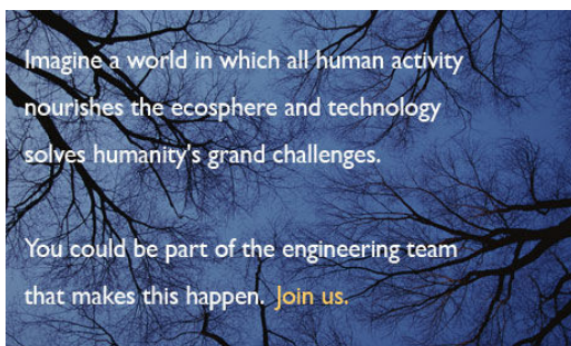
Figure 1. Cal Poly Materials Engineering department website 4 displays the sustainability theme in the curriculum.

The engineer for the year 2020 1 has been proposed to be somewhat different from the current engineering student. ABET also requires programs to train students to solve problems and to design within realistic design constraints that include sustainability 2 . The Brundtland Commission has defined sustainability as “development that meets the needs of the present without compromising the ability of future generations to meet their own needs.” 3 Accordingly, our materials engineering curriculum at Cal Poly is currently being revised to nurture more global, effective materials engineers for the future. Our department website 4 highlights our commitment to sustainability (Figure 1).