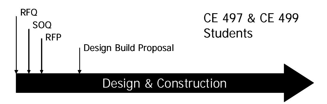
Figure 3. Design-Build Course Elements

The design-build course was developed to keep the strength of the previous capstone courses, which was the project-based approach where students worked on real life projects. One improvement to the previous courses was that the design and construction components were now combined, and likewise, the engineering and construction management students were combined onto design-build teams. For many students, this was the first time they had to work with someone outside their degree program (i.e., engineers with construction managers and vice versa). The design-build teams were truly multi-disciplinary.