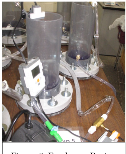
Figure 8. Freshman Design

A crucial element to the introduction of any technology to the classroom is the utility of the technology. LEGO^{TM} robotics kits are designed with engineering precision allowing users to quickly and repeatedly build prototypes of projects conceived and designed by students. Added capabilities are gained by