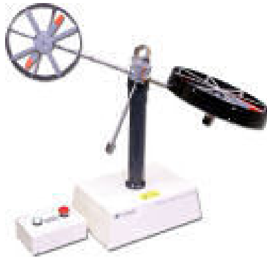
Figure 2 Twin rotor system [ http://www.fbk.com/product.aspx?pid=33-007 ]

The second physical system employed in this project was the twin rotor system produced by Feedback Instruments Limited shown in Figure 2. For the purposes of this project, the twin rotor was constrained to move only in a vertical plane and only one of the two rotors was used for control. The rotary dynamics of this system is relatively straightforward for the students to model, but the dynamics of the thrust produced by the rotor had to be supplied to the students. A difficulty that arises with this model is that the thrust dynamics and the overall rotational dynamics are both nonlinear. Therefore, the students had to generate a linearized model for the system, and as was the case with the mass-spring-damper system, they observed that the modeled behavior and the actual behavior did not match exactly.