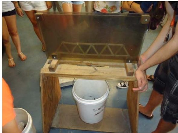
Figure 1 Warren Truss Bridge

Figure 5 demonstrates how students place load into the bucket. The loading process will not stop until the wooden truss bridges break and fail. Figure 6 and 7 present wooden truss bridge in the frame before and after loading. Figure 8 shows a typical truss bridge failure outside the frame.