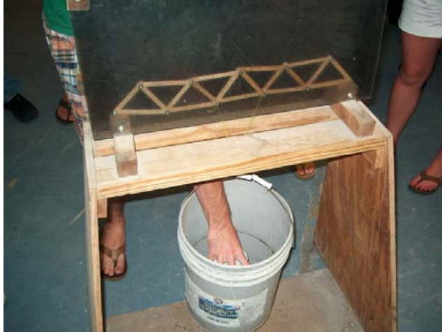
Figure 5 Loading of truss bridge