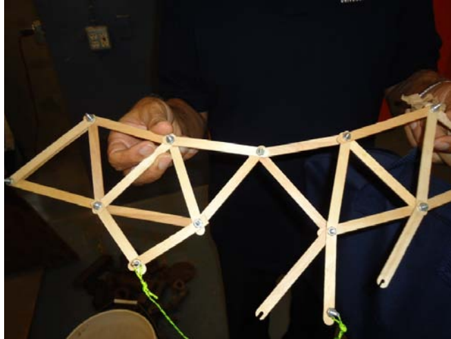
Figure 8 Typical Truss Bridge Failure

Scores for the wooden truss bridge can be calculated using equation 1,