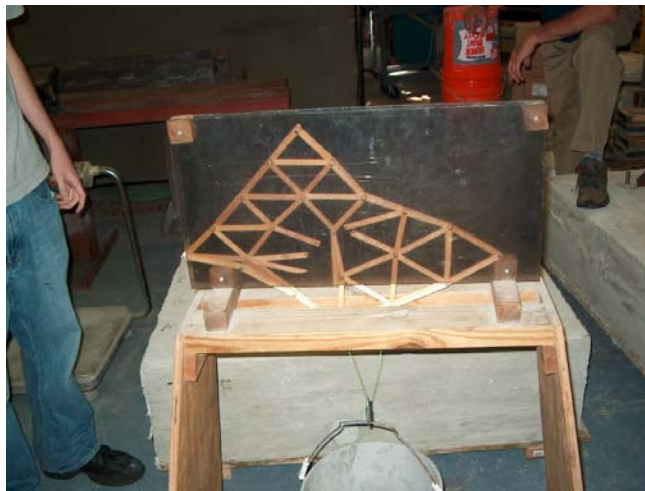
Figure 7 After Loading.