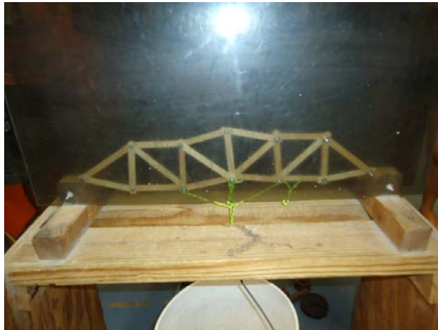
Figure 3 Pratt Truss Bridge