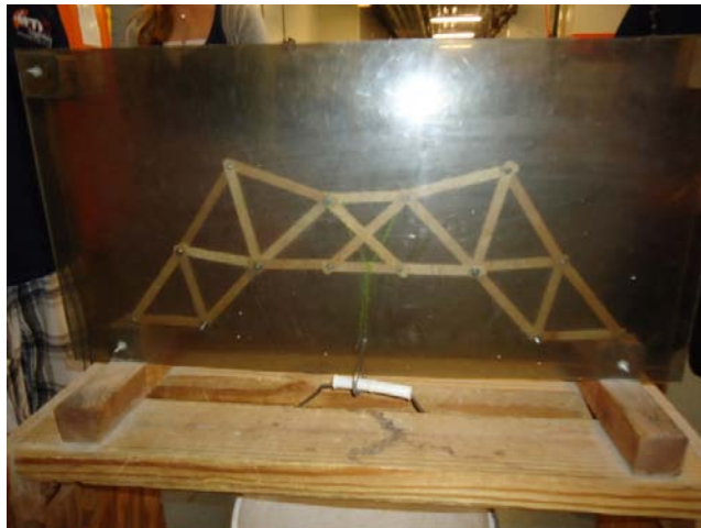
Figure 4 Creative Truss Bridge